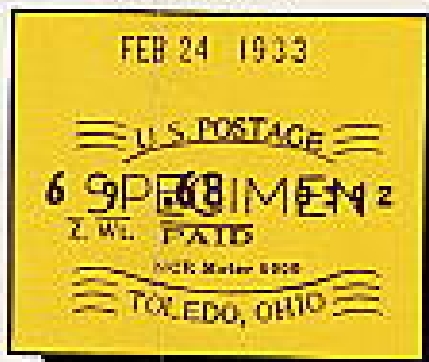
Parcel Post Labels

Provides a quick and accurate method of making report to post office as to amount of postage and number of pieces in each day's mailing.